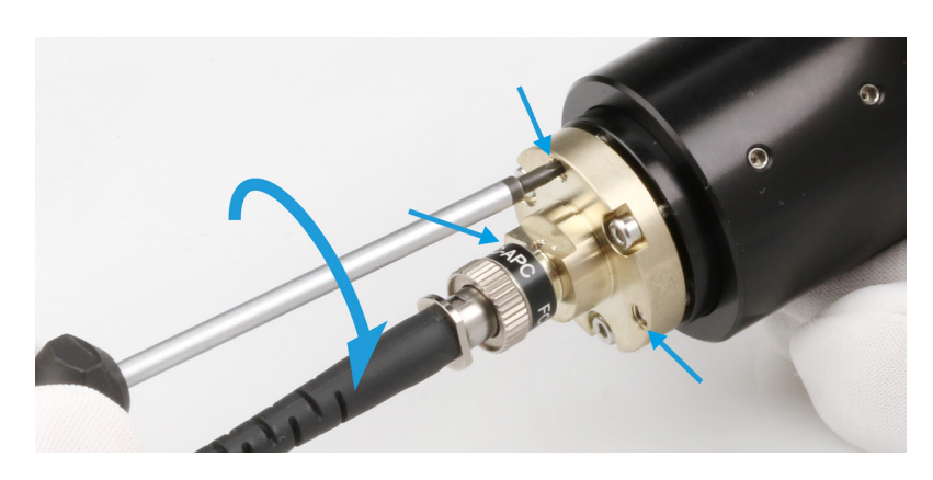
Figure 15: Finally, lock the three grub screws. Use a torque of max. 40 Ncm.

A second option can be used only when the fiber collimator has a clear aperture that is small with respect to the fiber NA. Then the collimated beam is truncated by the aperture of the fiber collimator at a lower level of the Gaussian intensity distribution: Observe the collimated radiation on a screen placed in front of the fiber collimator (for laser safety or in case of invisible radiation use a camera for this purpose). The alignment of the optical axis is best when the beam truncation seen on the screen is axially symmetric.