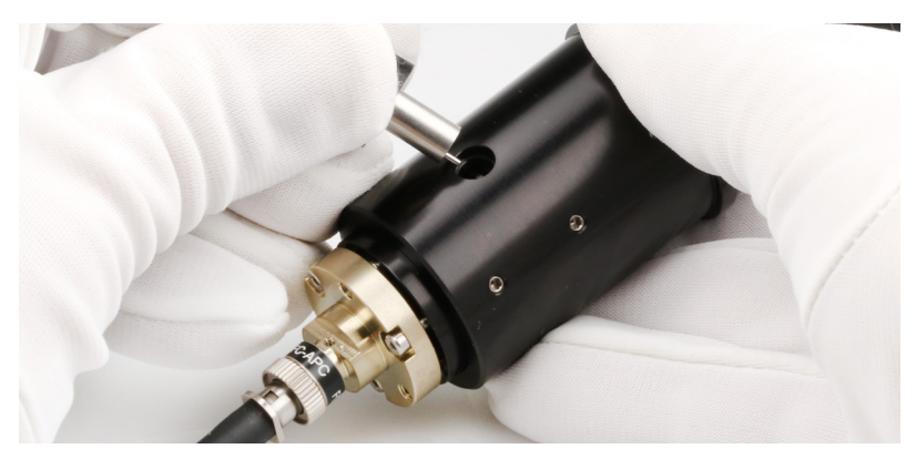
Figure 10: Insert the eccentric key type 55EX-5

The number of clamp screws (2 - 6) depends on the individual type of fiber collimator. For the exact position of these clamp screws please refer to the technical drawing of the individual fiber collimator, respectively.