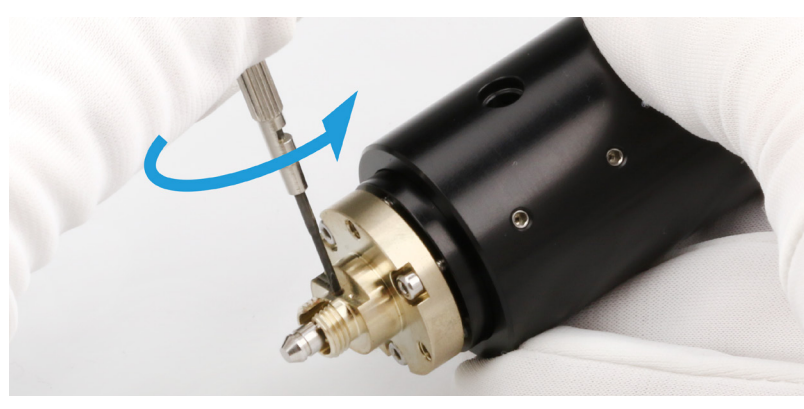
Figure 2: Then, slightly loosen the small pin screw. Use the screwdriver 9D-12. Make sure to not loosen it too far, as it is small and easily lost.