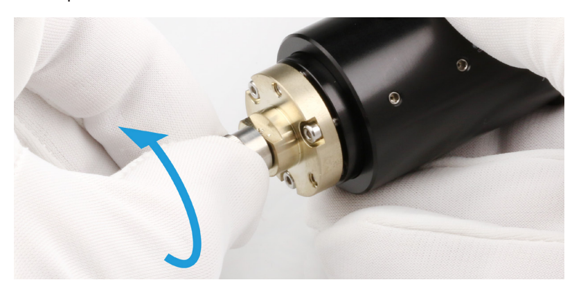
Figure 1: First, remove the threaded cap from the fiber receptacle of the fiber collimator.

There is a two-part protection cap on the receptacle. Please perform the following steps in order to remove this cap: