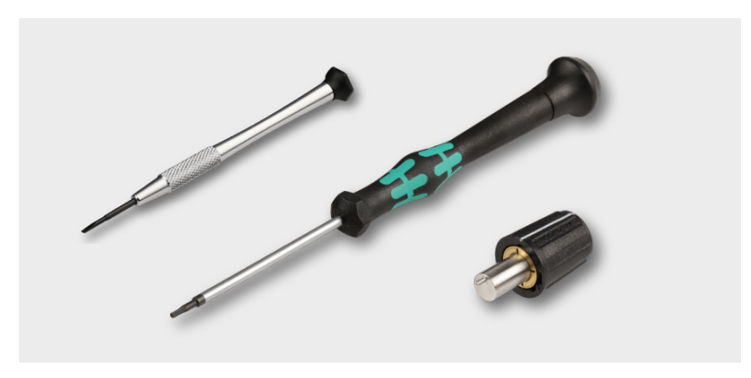
Figure 16: Screw driver type 9D-12, hex key 50HD-15, and eccentric key type 55EX-5.

For assembling and adjusting the fiber collimators series 60FC-T you need the following tools: