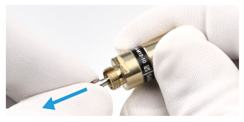
Figure 3: Now, pull out the plug.

Then, slightly loosen the small pin screw. Use the screwdriver 9D-12. Make sure to not loosen it too far, as it is small and easily lost.