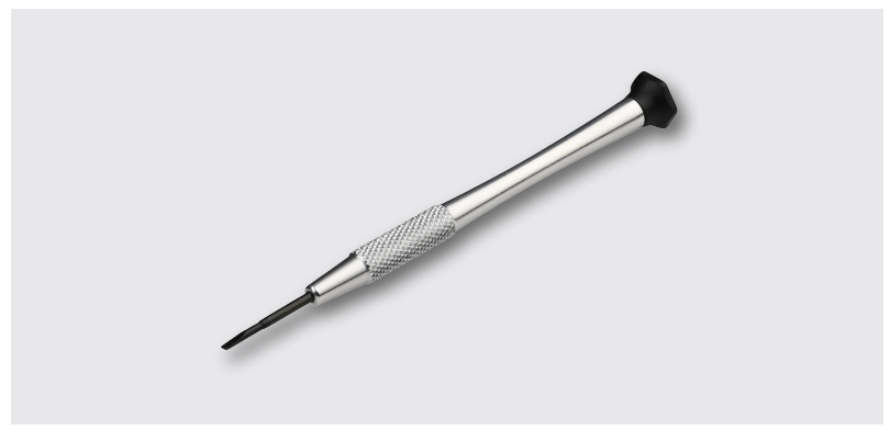
Figure 12: Screw driver type 9D-12 and eccentric key type 60EX-4 or type 60EX-5.

For adjusting the fiber collimators series 60FC you need the following tools: