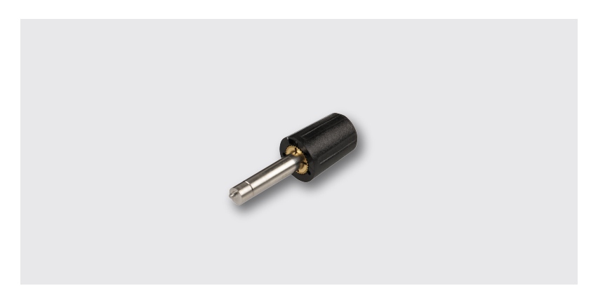
Figure 13: Eccentric key type 60EX-4 or type 60EX-5.