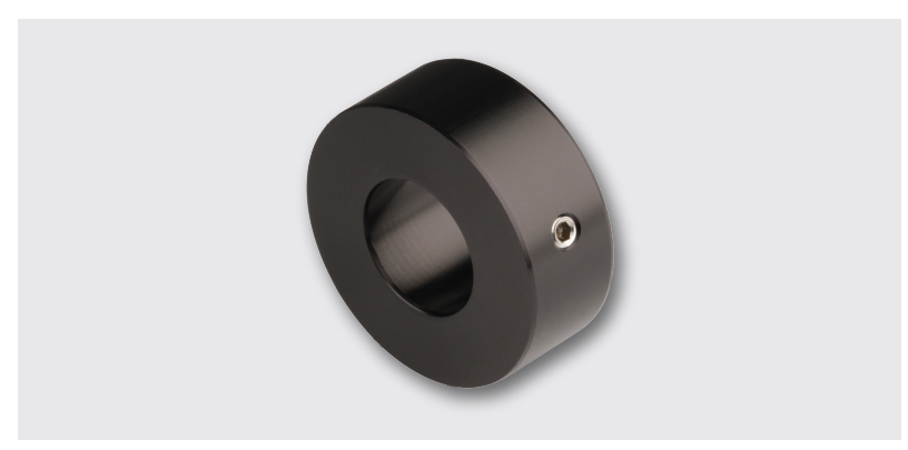
Figure 14: Adapter ring type 12C-AM25 with an outer diameter 25 mm for placing the fiber collimator into a standard mirror mount.