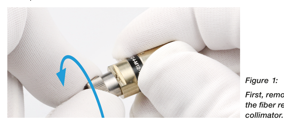
Figure 1: First, remove the threaded cap from the fiber receptacle of the fiber

There is a two-part protection cap on the receptacle. Please perform the following steps in order to remove this cap: